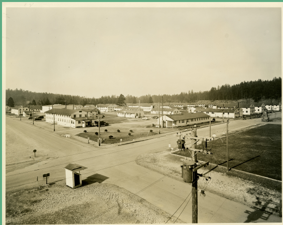
Fort Lewis POW Camp

The prisoner population consisted of mostly German soldiers from the Afrika Korps captured in Tunis North Africa, Italy, France, and Greece. The camp held approximately 4,000 to 5,200 prisoners.