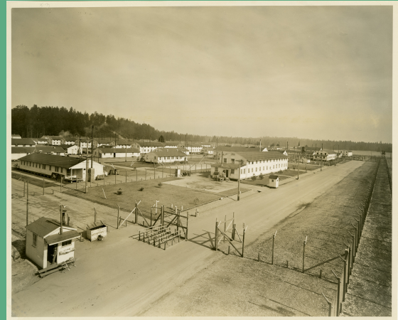
Fort Lewis POW Camp

The prison camp began small but quickly grew to five separate compounds on post along with branch camps at Fort Lawton, Spokane, Walla Walla, Vancouver Barracks, and Toppenish. The main camp was set up north of Gray Airfield in the area near 41st Division Drive and Pendleton Avenue. The Prisoners were housed using the same World War II wooden buildings occupied by American troops.